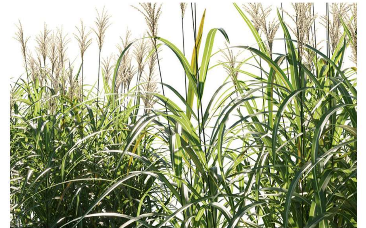
Miscanthus x giganteus