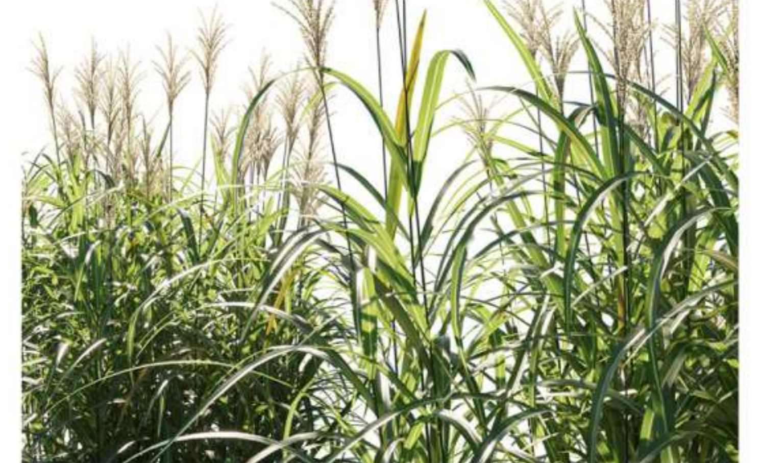
Miscanthus x giganteus